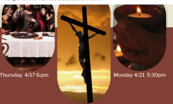
Friday 4/18 12:30pm

7 a.m. - St. Alphonsus 9 a.m. - St. Alphonsus 10:30 a.m. - Blessed Sacrament