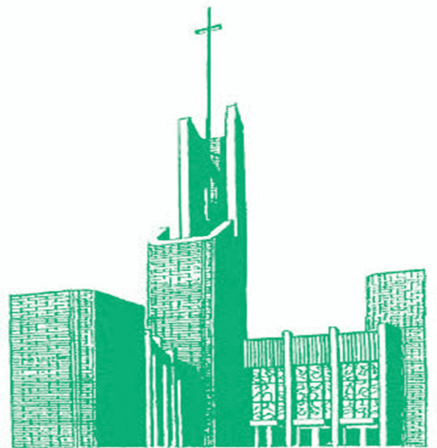
THE CHURCH OF THE EPIPHANY

The Church of the Epiphany 375 Second Avenue and 22nd Street New York, NY 10010