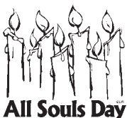
All Souls Day

Please return your envelopes for All Souls Day by Monday, November 2