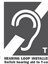
HEARING LOOP INSTALLED Switch hearing aid to T-coil

To use this service, the hearing aid wearer must sit in the first five rows behind the Lector pew on the left side of the church, facing the pulpit.