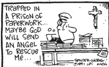
PETER AND PAUL, APOSTLES

Our committee's work will ensure that we carry on the tradition of beautiful sacred music that we have enjoyed at Epiphany for many years.