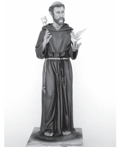
St. Francis of Assisi