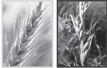
Wheat and Tares

Nobody wants weeds in a garden. We just pull them up when we find them. So why does the master in Christ's parable let them grow among his wheat?