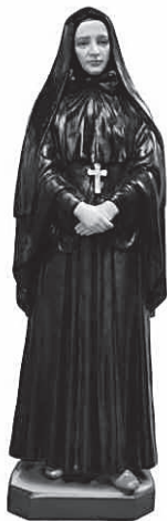
St. Frances Xavier Cabrini

The statues of St. Francis and Pope John Paul II are now available for memorializing. If you would like to contribute in memory of a loved one, please call the rectory office for more information.