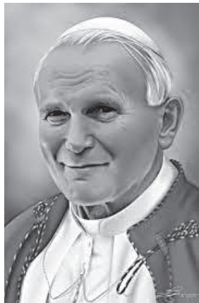
St. Pope John Paul II