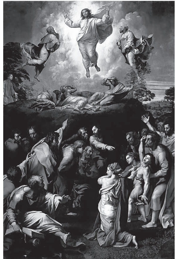
Transfiguration by Rafael

They may have been meant only as momentary glimpses of the joy of heaven to sustain us as we face the challenges of this life, to help strengthen us on the road that will--ultimately--bring us into the infinite and endless joy of heaven.