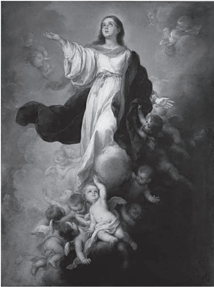
Assumption of the Virgin by Bartolome Esteban Murillo