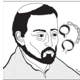
St. Peter Claver