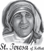
St. Teresa of Calcutta