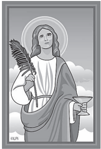
Feast of St. Lucy December 13

Sunday - Mass for Installation of Cabrini statue - 12:00 (CH) Light Refreshments - after 12:00 Mass (PH) Baptism - 2:00 PM (CH) Monday - School Thanksgiving Mass - 9:00 AM (CH) Daisy Troop 3114 - 2:30 PM (PH) Tuesday - 22 Club - 12 PM (PH) SPECIAL MASS OF THANKSGIVING - 5:30 PM (CH) Contemplative Prayer - 7 PM (CH) Wednesday - OLPH Novena - after 12:10 Mass (CH) Legion of Mary - 5 PM (rectory) Thursday - Thanksgiving Day Business Office & School closed thru Mon, Nov 27 NO 12:10 MASS Friday - NO MASSES TODAY