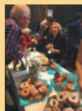
COFFEE & DONUT FELLOWSHIP