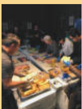
OUTREACH TO THE HOMELESS AND THE POOR