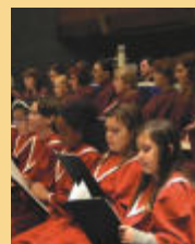
CHOIRS AND MUSIC PROGRAM