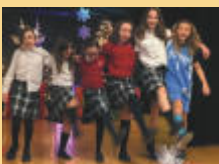
YOUTH GROUP & TEEN ACTIVITIES