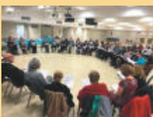
INTERFAITH & SPIRITUAL ACTIVITIES

AND MANY OTHER MINISTRIES! YOUR GIFT WILL HELP US TO GROW EPIPHANY,