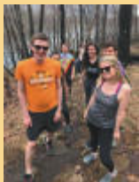
YOUNG ADULTS & ALPHA PROGRAMS