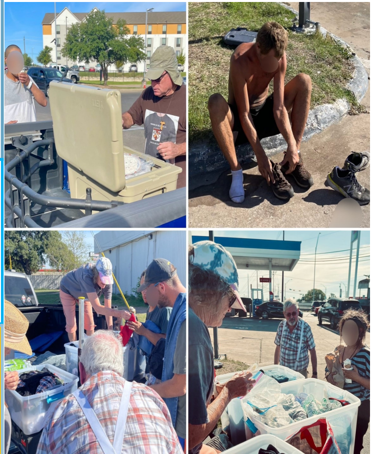
Photos of October 2023 Homeless Apostolate