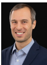
St. Augustine Parishioner