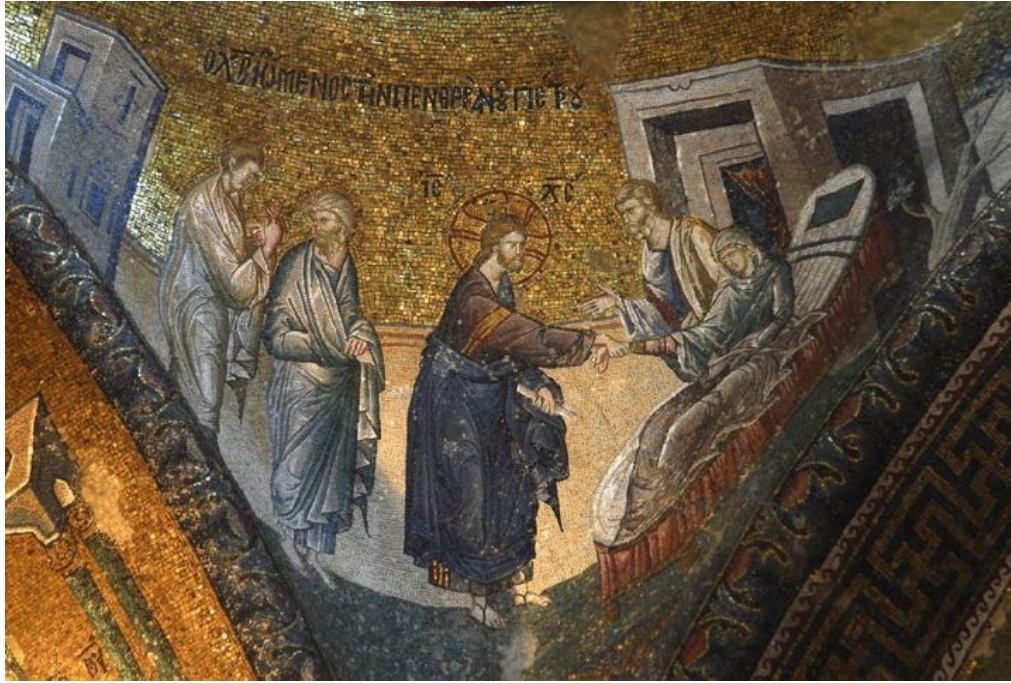
Christ Healing Peter's Mother-In-Law

St. Augustine Catholic Church sits between Cannon Hill and Manito Parks in the heart of Spokane's historic South Hill neighborhood. It has provided a place of worship for generations of Catholic families and serves the students of Cataldo Catholic School.