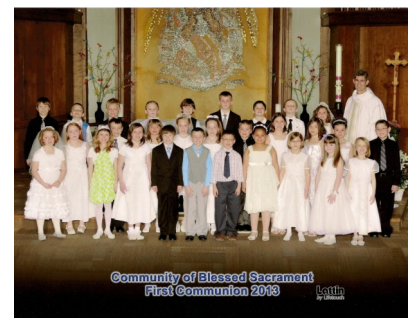
Community of Blessed Sacrament First Communion 2013

We were blessed again this year with a great communion class. Welcome to the Table of the Lord. May you return often.