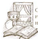
COMMUNION FOR THE HOUSEBOUND

Mass Requests for 2018: The Mass "book" for 2018 will be open for reservations as of Tuesday, February 28 th . Because of the number of Parishioners who wish to arrange Masses at St. John's, we must request that Mass reservations be made in person. On February 28 th those seeking to make Mass reservations should do so in the lower church (not the rectory) starting at 9:00 a.m. Someone will be there all morning and in the afternoon until 3:00 p.m. After February 28 th , Mass requests for 2018 should be made in the rectory, Monday-Friday from 9:00 a.m. – 3:00 p.m. Our office staff is simply unable to handle requests by phone if they are to complete the regular volume of work they have. In addition, individual Mass reservations are limited to three on February 28 th , so we may accommodate as many parishioners as possible. ( After the initial day, more Mass reservations may be made at the rectory later in the week. ) We remind everyone that there are a number of retired priests who are able to take Mass requests – even for 2017. We are happy to provide Mass cards for these Masses; however, they will not be celebrated here at St. John's.