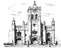
St. Julie Billiart 224 Dayton St. 863-1040