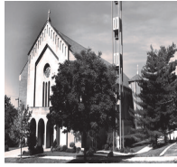
St. Peter in Chains 382 Liberty Ave. 863-3938