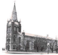
St. Joseph 171 Washington St. 863-1424