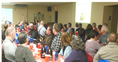
Trivia Night February 4

Cost: Adults $9.00, Seniors & Teens $8.00, Children $4.00, Family $25.00