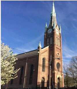
St. Joseph Church 171 Washington Street Hamilton, Ohio 45011 513-863-1424