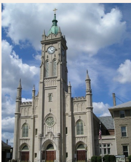
St. Julie Billiart Church 224 Dayton Street Hamilton, Ohio 45011 513-863-1040