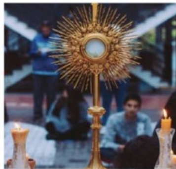
March Formation Topic* Divine Mercy

Join With The Family of Parishes for Second Sunday!! We will have faith formation and dinner!! Please bring a dish to share and enjoy the evening with family and friends.