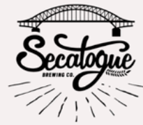
Secatogue Brewing Co.