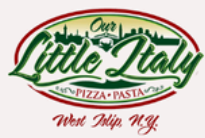
Our Little Italy