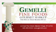
Gemelli Fine Foods