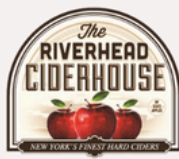
Riverhead Cider House