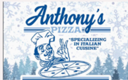
Anthony's Pizza Mastic Beach