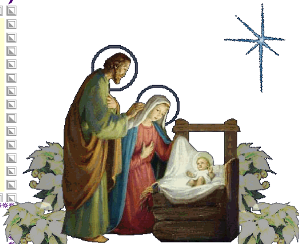
Nativity of Our Lord and Savior

Parish offices are located in the Religious Education Bldg.